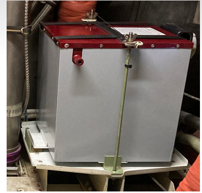
RG-380E/53L installed with 5-0730 kit