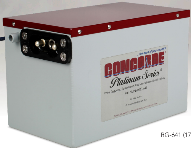
RG-641 (17 Ah)

2009 San Bernardino Road | West Covina, CA 91790 USA 626-813-1234 | Fax 626-813-1235 | www.ConcordeBattery.com ISO 9001 + AS9100 | Crafted for Quality in the U.S.A.