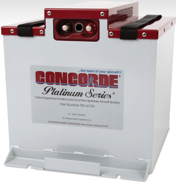
RG-41/53 | 53 Ah